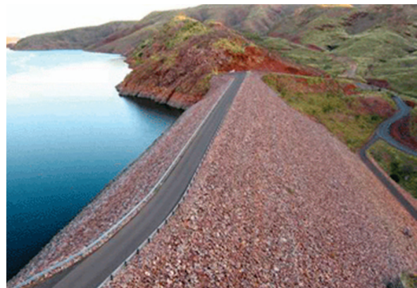
Rock and earth wall dam