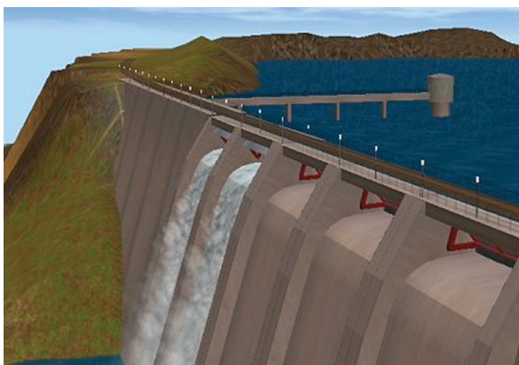
Concrete wall dam